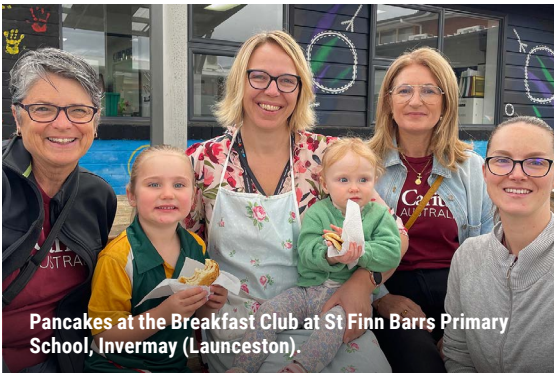
Pancakes at the Breakfast Club at St Finn Barrs Primary School, Invermay (Launceston).