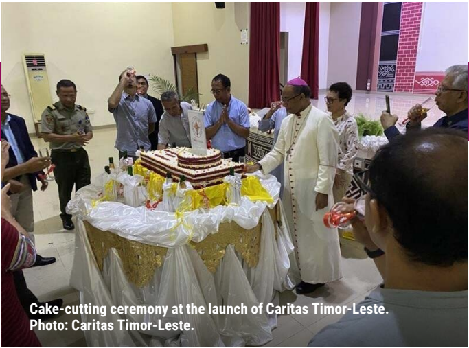
Cake-cutting ceremony at the launch of Caritas Timor-Leste.

Caritas Australia has been a dedicated partner in supporting the development of Caritas Timor-Leste. The generosity and commitment of supporters like you have been instrumental in helping to bring the organisation to