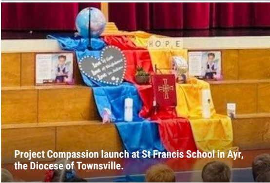
Project Compassion launch at St Francis School in Ayr, the Diocese of Townsville.