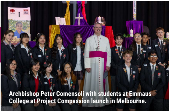
Archbishop Peter Comensoli with students at Emmaus College at Project Compassion launch in Melbourne.

Caritas Australia launched Project Compassion 2025 across Hobart, Launceston, and Burnie, marking Burnie's first launch. The team travelled over 800 km in 60 hours, engaging with parishioners and visiting five primary schools. They also kicked off the Long Walk for Water campaign during the trip.