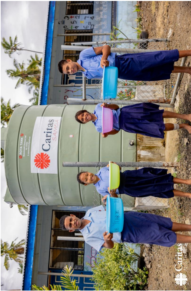
Students stand with water buckets in front of a water tank at a Samoan primary school.