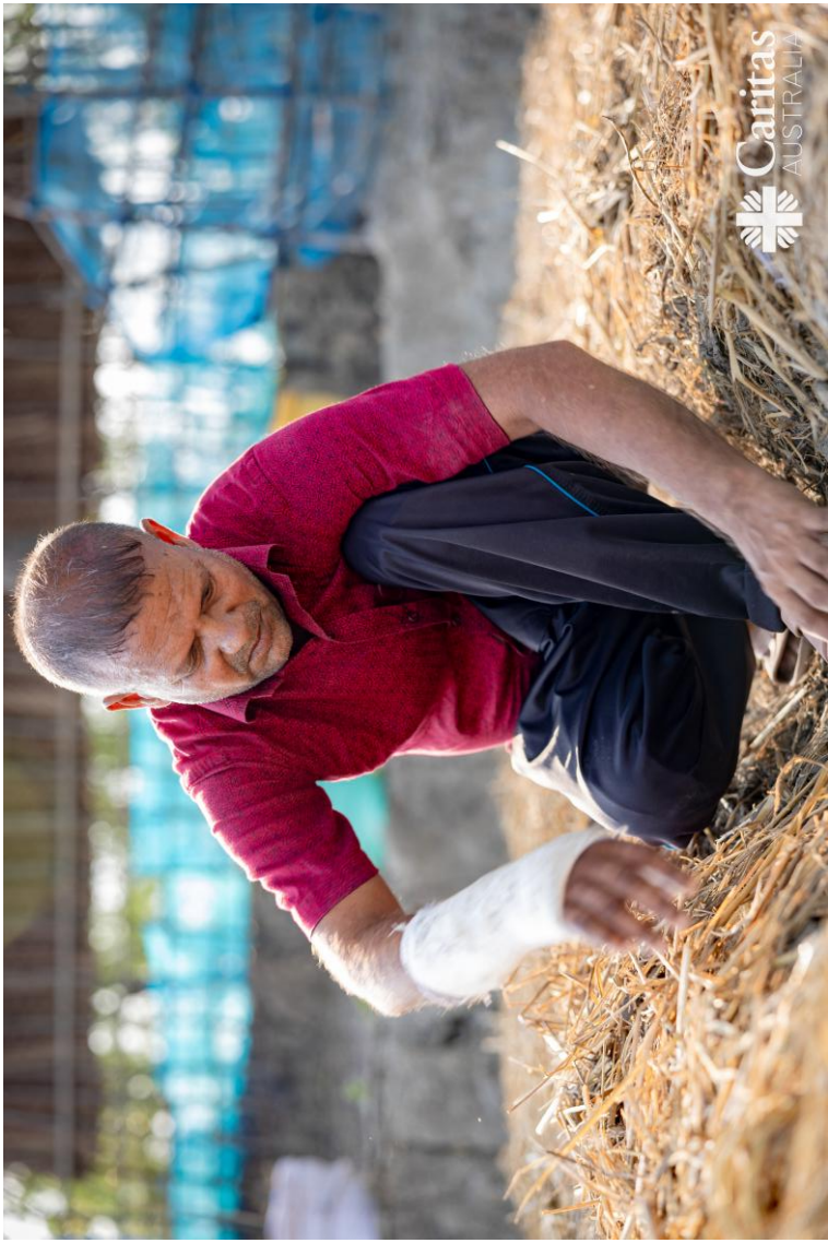
Monoranjon uses climate-resilient farming techniques to create a more sustainable future.