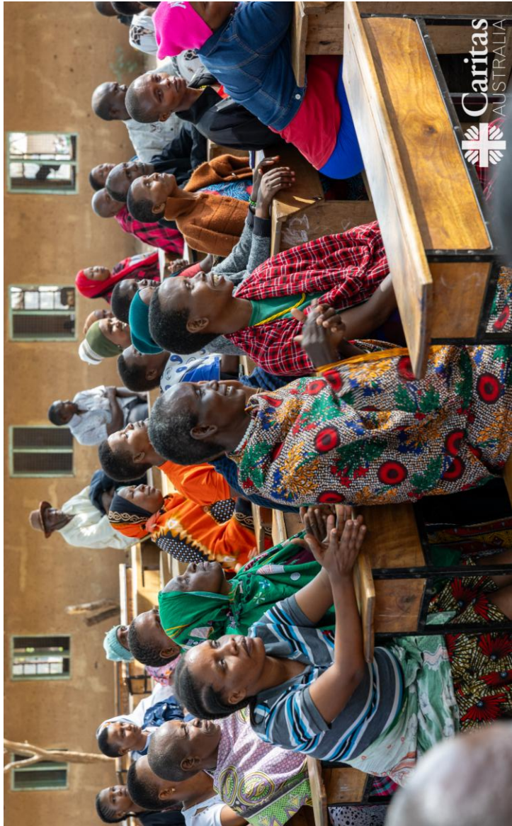
Parents learn about water, hygiene and sanitation from their children.