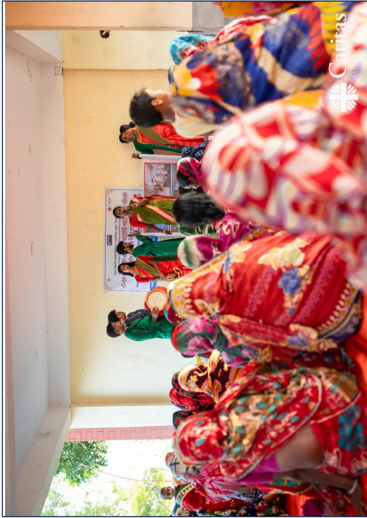
A community group doing climate change activism through songs.