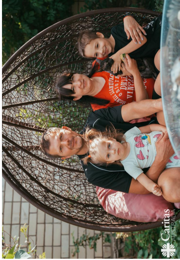
A family in Ukraine who has been displaced by the war.