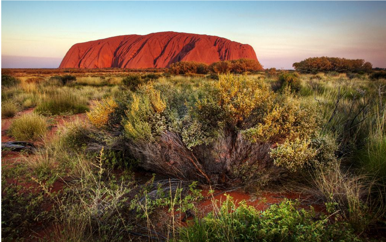
The Uluru Statement From the Heart.