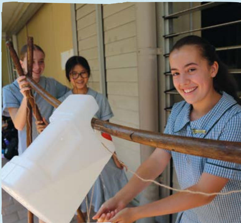
Students from High Schools around Sydney came to St Ursula's College in Kingsgrove to celebrate the work of Caritas Australia at Project Compassion.