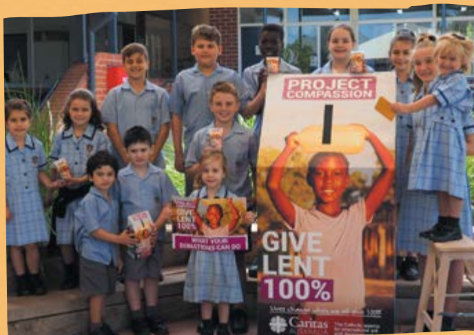
Students at St Joseph's School Tranmere, Adelaide.

Thanks St Joseph's Tranmere for always stepping up and giving 100% for Caritas Australia!