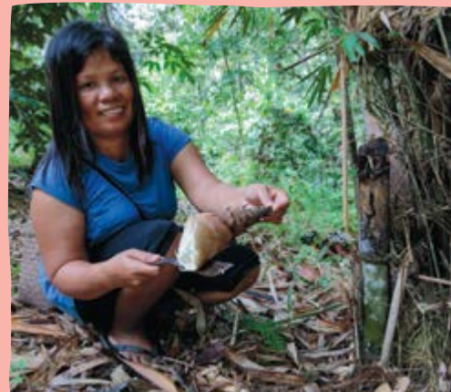
Tati is being equipped with environmentally sustainable forest practices through the support of Caritas Australia.

• October 2019 is the Special Assembly of the Synod of Bishops of the Pan-Amazon Region. Pope Francis has called the Synod to discuss the preservation of the rainforest and the rights of rural and tribal communities connected to it.