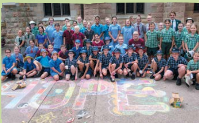
Students come together for Project Compassion at Stephen's Cathedral in Brisbane.

Students came together to create, learn and pray in support of the work of Caritas Australia.