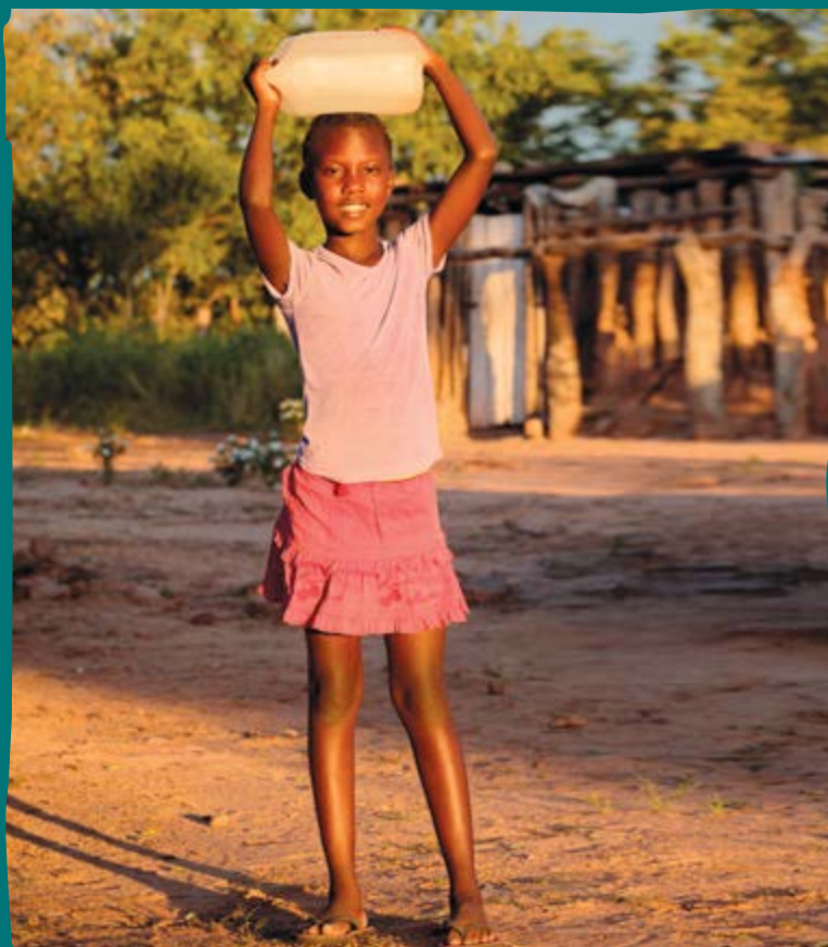
Thandolwayo outside her home holding a five litre water container she uses to collect water.

"The distance to collect water for the family has been drastically reduced. We now drink clean, safe water and diseases are no longer affecting us".