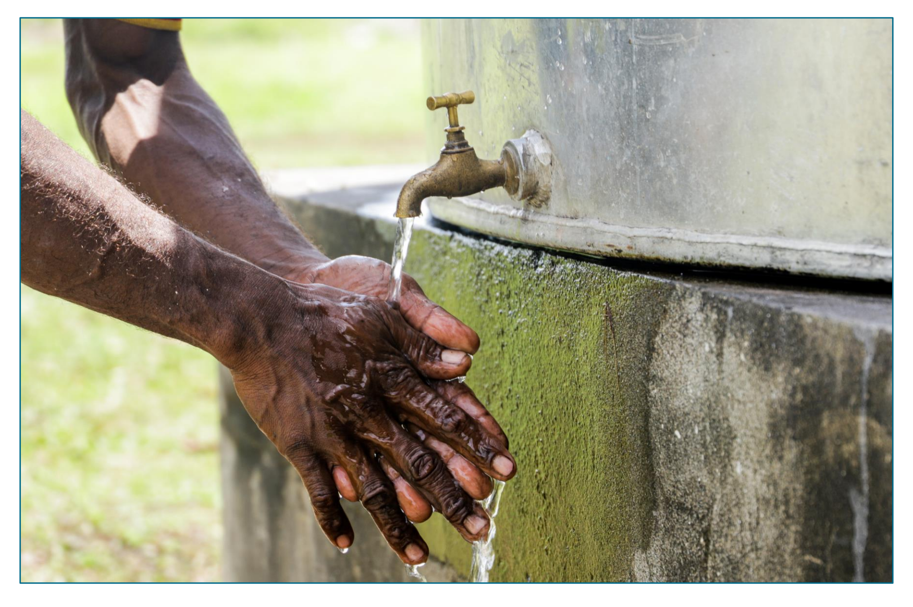
Now they have enough drinking water for the whole year!