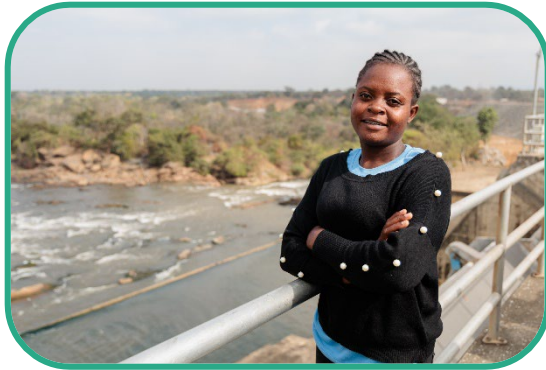
Memory stands on a bridge at the hydroelectricity station, water rushes below.

Make a water wheel to demonstrate hydroelectricity.