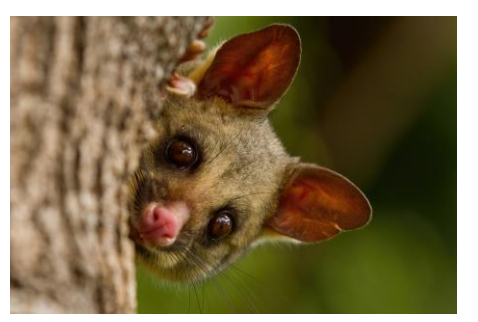
Brushtail Possum

The earth is getting drier and warmer which is changing the living conditions for Australian plants and animals. Humans clear native bush to make space for us to live or to grow food. This is making it difficult for our Australian animals to find a good place to live where there is food and shelter.