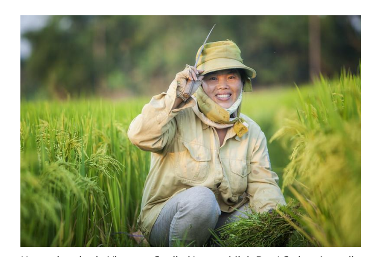
Harvesting rice in Vietnam.

Learn more using the "Introduction to Caritas Australia" PowerPoint.