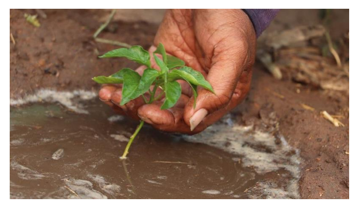
Planting beans in Cambodia.

Use this <u>Field guide App</u> to help you identify what you find. There is one for each state and it's free. There are many other references you can Google to assist you or to carry out extension work after this activity.