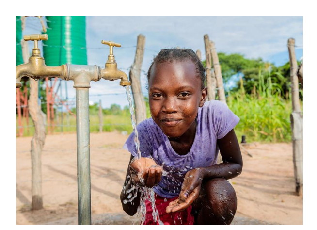
Thandolwayo collecting water in Zimbabwe.

Write an Acrostic poem using the word "water". Here is one to give you some ideas.