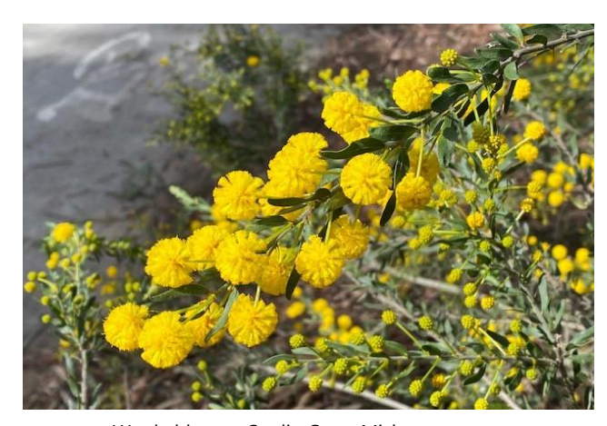
Wattle bloom.

Catholic Earthcare is encouraging all schools and parishes to take action for our common home in answer to the urgent appeal from Pope Francis' encyclical and the Action Platform for Laudato Si'. We are also responding to the call from our Australian Catholic Bishops in the Social Justice Statement 2021-22, "Cry of the Earth, Cry of the Poor".