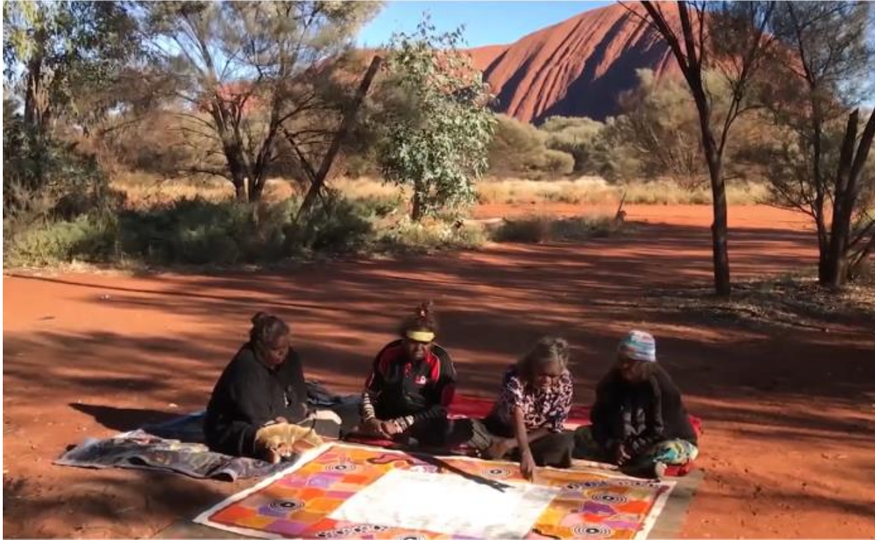
The Uluru Statement From the Heart.